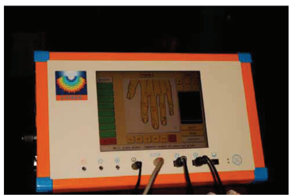
The Biophoton device J. Boswinkel, the CHIREN that has been used in all researches.

The Chiren is an instrument that consists of two parts: One assessment system to see where and what the disturbances are and one part that corrects them. The assessment system has its base in the EAV(Electro-Acupuncture- according to Voll). It simple measures the galvanic resistance of the skin and what is being observed is: a straight line or a hyperbole. When it is a hyperbole, there is something wrong, with a straight line everything is in order. This is a QUANTATIVE measurement. But this indication corresponds fully to the biophoton measurements. Also when one measures biophoton emission one gets a straight line when there is maximum coherency and a hyperbole when the light is chaotic. Also the biophoton measurements are quantative. This measurement is followed by a measurement of the QUAL-ITY of the point. If the previous measurement showed a hyperbole, then another measurement has to follow in order to see WHAT is wrong. This measurement will determine on the basis of the quality of the chaotic signal that comes from the body what the disturbance is. The treatment section of the Chiren is then able to send back the opposite signal into the body, thereby neutralizing the disturbing signal.